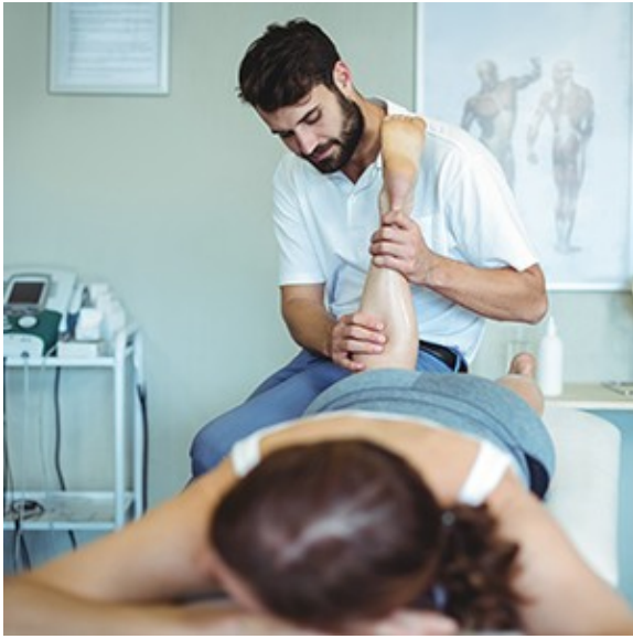
On-Site Physio and Massage